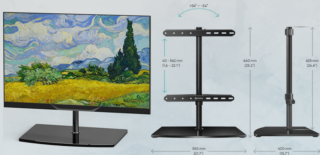
Tabletop stand with tempered glass base for all major display sizes.